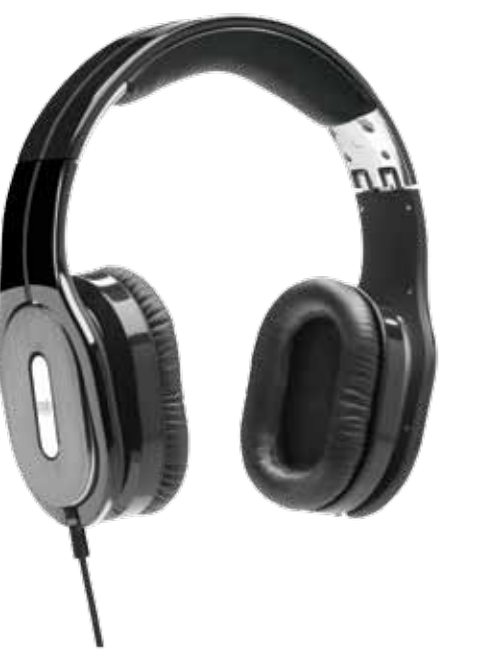
M4U 2 Active Noise Cancelling Headphones

The M4U 2 model features three convenient listening modes: Active Noise Cancellation (ANC) with Room Feel™, Active Mode with Room Feel™, and Passive Mode (for use without batteries). You can listen all day and all night with a whopping 55-hour run time in ANC or Active modes. And when you're out of batteries, switch to Passive Mode without missing a beat.